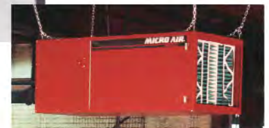
Ambient Air Cleaners